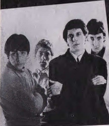
Top right: From the upcoming Who film "Quadrophenia" Above: Vintage Who

Words and music by Pete Townshend Reproduced by permission Febulous Music